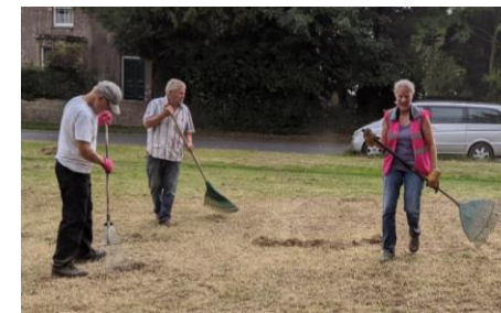
Helping people create a wildlife meadow