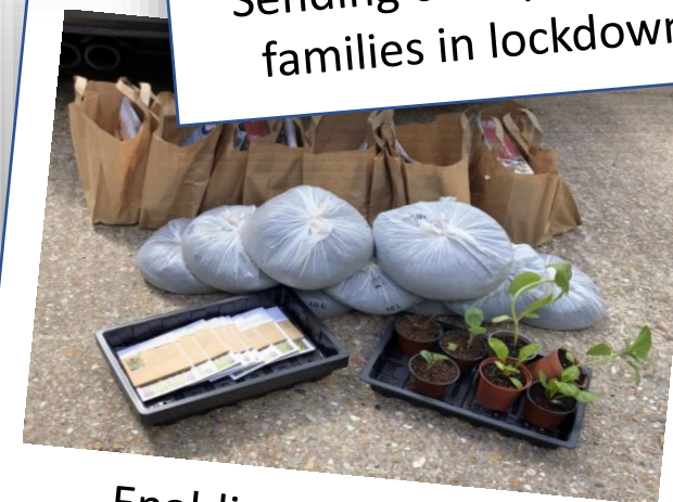
Enabling Veterans to grow seeds from home