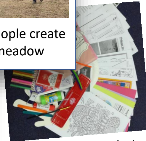
Sending craft packs to families in lockdown